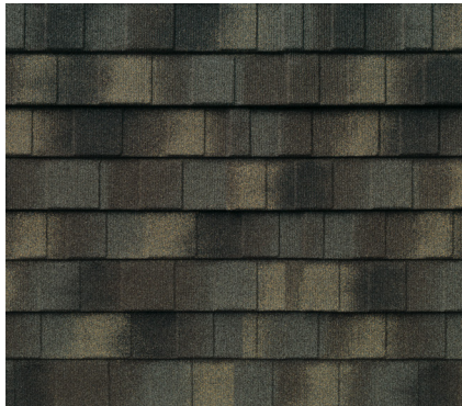
DECRA SHINGLE XD Classic Cobblestone