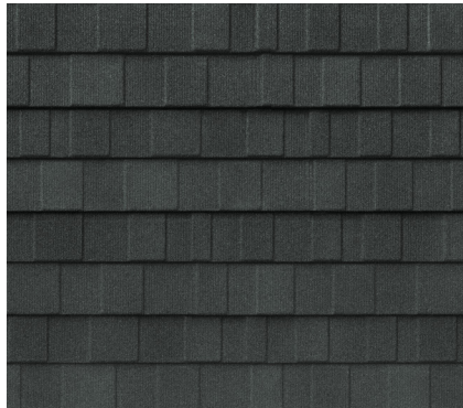
DECRA SHINGLE XD Midnight Eclipse