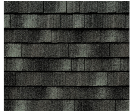
DECRA SHINGLE XD Natural Slate