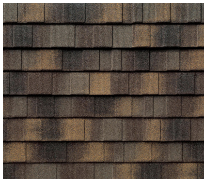
DECRA SHINGLE XD Old Hickory